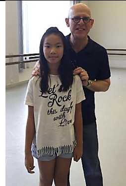
Play Drama! 8 – 12 yrs