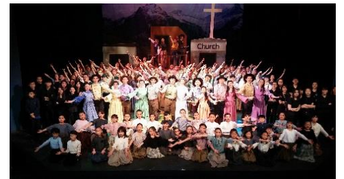
Hong Kong Academy for Performing Arts