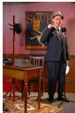
A Radio Play: Midsummer Night Dream