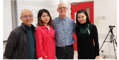
Drama-based Public Speaking